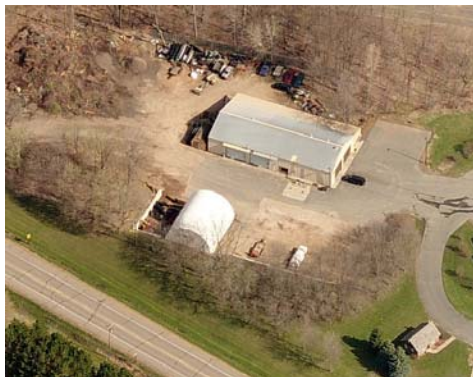
Existing Public Works Facility Site

The City of Medina's existing Public Works Facilities are located at 2052 County Road 24, on the same site as City Hall. The existing facilities consist of a 7,400 sq. ft. building for storing vehicles, maintenance area, equipment and offices, as well as an outdoor storage area, salt shed, fueling facility and brush pile.