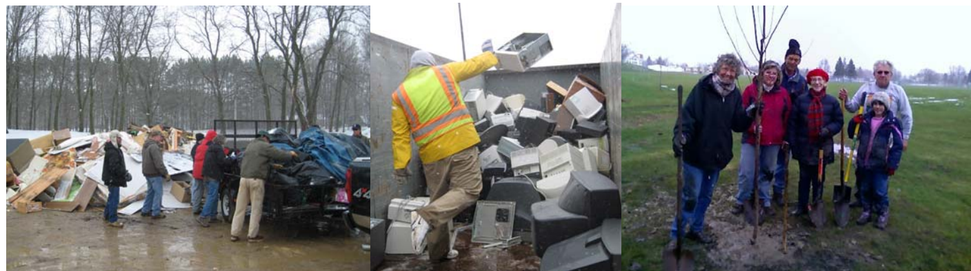
Volunteers unload trailer after trailer of garbage.

Thank you to all the dedicated Medina Clean Up Day volunteers. This event could not of happened without you!