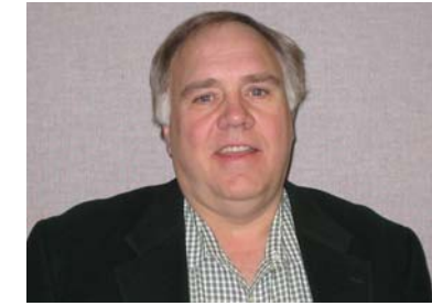
Mayor Bruce D. Workman