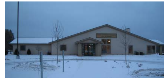
* More details on Hamel Community Building use on page 2